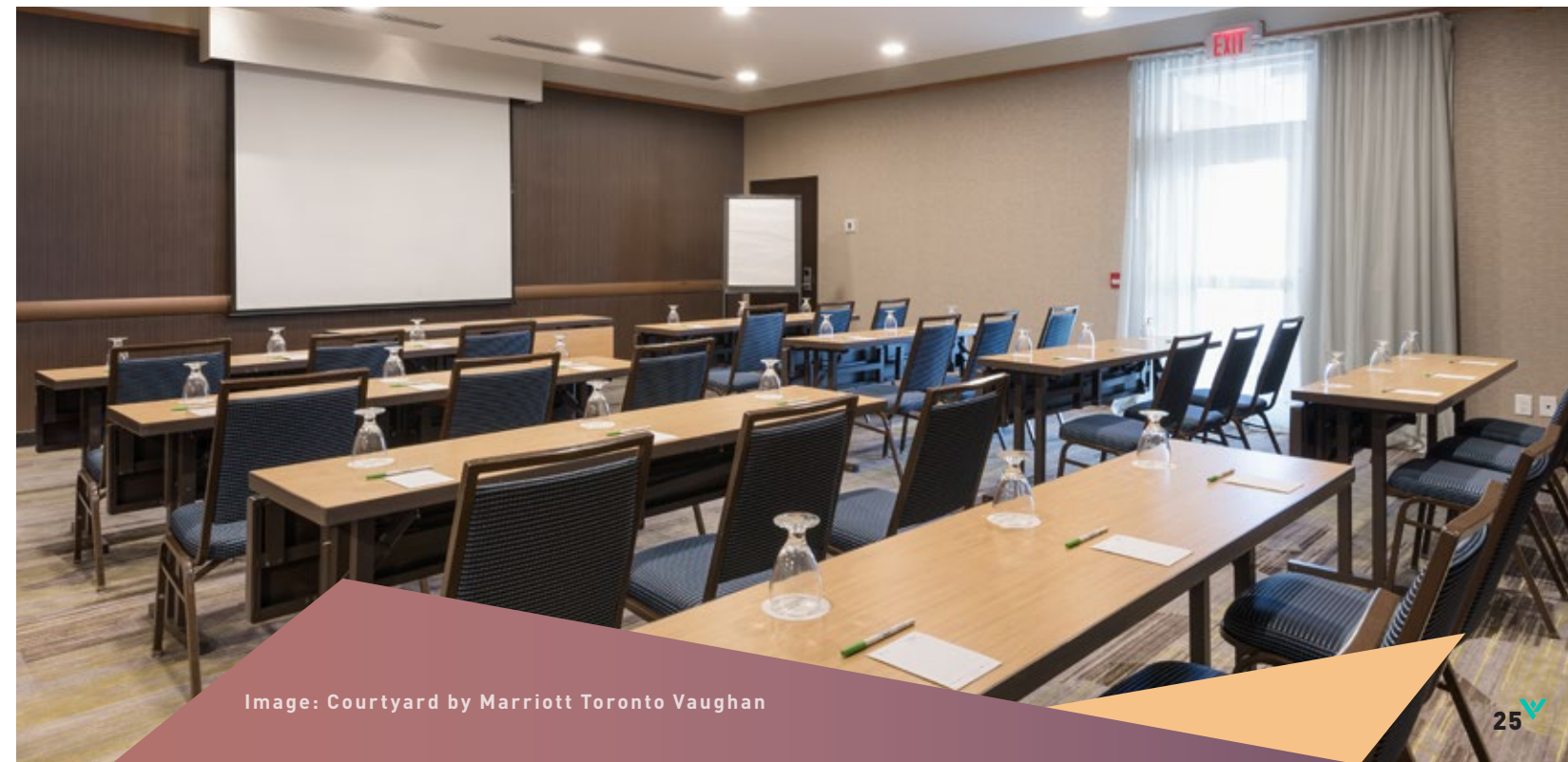
Image: Courtyard by Marriott Toronto Vaughan