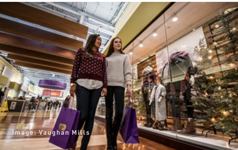
Image: Vaughan Mills

WE AIM TO CREATE STRONG LOCAL, REGIONAL AND PROVINCIAL TOURISM PARTNERSHIPS FOR VAUGHAN.