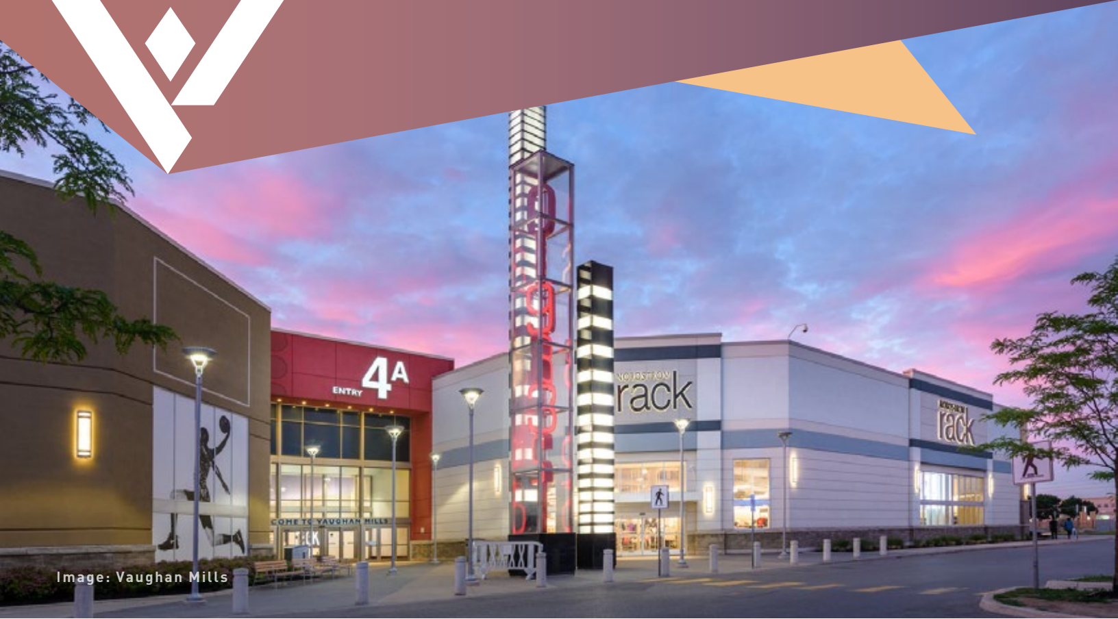
Image: Vaughan Mills

budgets similar to Tourism Vaughan’s would typically expect to have 5 tourism staff responsible for the three functional areas. The City’s arts and culture mandate is an additional functional area which should require a distinct staffing plan.