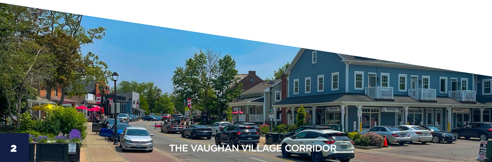
THE VAUGHAN VILLAGE CORRIDOR

Vaughan's Economic Development department supports small business owners and entrepreneurs from ideation to expansion, offering business advisory services, seminars, workshops and more.