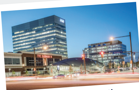
VMC TTC Subway Station