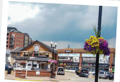
Market Lane Shopping Centre