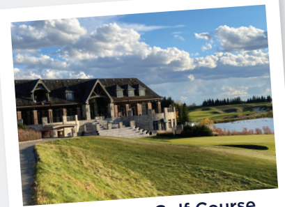
Eagles Nest Golf Course