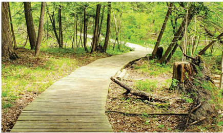
Kortright Centre for Conservation