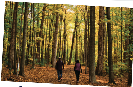
Sugarbush Heritage Park